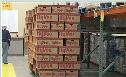
CHRISTMAS FOOD BASKETS